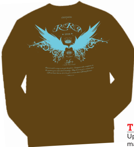
Shirt design shown here is the back of last year's.